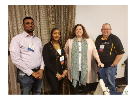
The School of Interdisciplinary Studies and Professional Development Monthly Potluck Lunch